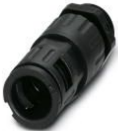
Cable gland, metric thread, IP66 protection, with strain relief

Please be informed that the data shown in this PDF Document is generated from our Online Catalog. Please find the complete data in the user's documentation. Our General Terms of Use for Downloads are valid ( http://phoenixcontact.com/download )