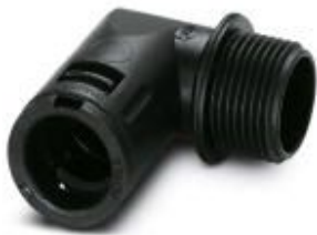
Cable gland, metric thread, IP66 protection, angled

Please be informed that the data shown in this PDF Document is generated from our Online Catalog. Please find the complete data in the user's documentation. Our General Terms of Use for Downloads are valid ( http://phoenixcontact.com/download )