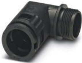
Cable gland, metric thread, IP66 protection, angled

Please be informed that the data shown in this PDF Document is generated from our Online Catalog. Please find the complete data in the user's documentation. Our General Terms of Use for Downloads are valid ( http://phoenixcontact.com/download )