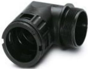
Cable gland, Pg thread, IP66 protection, angled

Please be informed that the data shown in this PDF Document is generated from our Online Catalog. Please find the complete data in the user's documentation. Our General Terms of Use for Downloads are valid ( http://phoenixcontact.com/download )