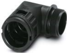
Cable gland, Pg thread, IP66 protection, angled

Please be informed that the data shown in this PDF Document is generated from our Online Catalog. Please find the complete data in the user's documentation. Our General Terms of Use for Downloads are valid ( http://phoenixcontact.com/download )