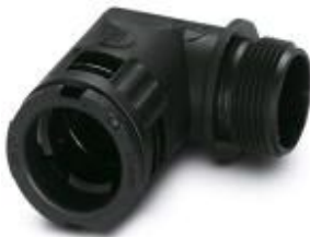
Cable gland, Pg thread, IP66 protection, angled

Please be informed that the data shown in this PDF Document is generated from our Online Catalog. Please find the complete data in the user's documentation. Our General Terms of Use for Downloads are valid ( http://phoenixcontact.com/download )