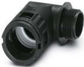
Cable gland, metric thread, IP68/69k protection, angled

Please be informed that the data shown in this PDF Document is generated from our Online Catalog. Please find the complete data in the user's documentation. Our General Terms of Use for Downloads are valid ( http://phoenixcontact.com/download )