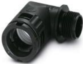
Cable gland, metric thread, IP68/69k protection, angled

Please be informed that the data shown in this PDF Document is generated from our Online Catalog. Please find the complete data in the user's documentation. Our General Terms of Use for Downloads are valid ( http://phoenixcontact.com/download )