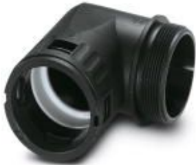
Cable gland, Pg thread, IP68/69k protection, angled

Please be informed that the data shown in this PDF Document is generated from our Online Catalog. Please find the complete data in the user's documentation. Our General Terms of Use for Downloads are valid ( http://phoenixcontact.com/download )