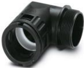
Cable gland, Pg thread, IP68/69k protection, angled

Please be informed that the data shown in this PDF Document is generated from our Online Catalog. Please find the complete data in the user's documentation. Our General Terms of Use for Downloads are valid ( http://phoenixcontact.com/download )