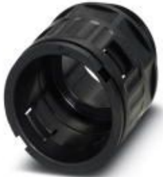
Cable gland, metric thread, IP66 protection, straight

Please be informed that the data shown in this PDF Document is generated from our Online Catalog. Please find the complete data in the user's documentation. Our General Terms of Use for Downloads are valid ( http://phoenixcontact.com/download )