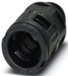
Cable gland, metric thread, IP66 protection, straight

Please be informed that the data shown in this PDF Document is generated from our Online Catalog. Please find the complete data in the user's documentation. Our General Terms of Use for Downloads are valid ( http://phoenixcontact.com/download )