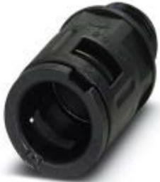
Cable gland, metric thread, IP66 protection, straight

Please be informed that the data shown in this PDF Document is generated from our Online Catalog. Please find the complete data in the user's documentation. Our General Terms of Use for Downloads are valid ( http://phoenixcontact.com/download )