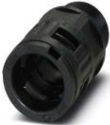
Cable gland, Pg thread, IP66 protection, straight

Please be informed that the data shown in this PDF Document is generated from our Online Catalog. Please find the complete data in the user's documentation. Our General Terms of Use for Downloads are valid ( http://phoenixcontact.com/download )