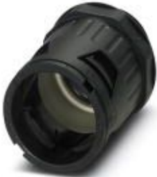
Cable gland, metric thread, IP68/69k protection, straight

Please be informed that the data shown in this PDF Document is generated from our Online Catalog. Please find the complete data in the user's documentation. Our General Terms of Use for Downloads are valid ( http://phoenixcontact.com/download )