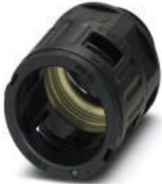
Cable gland, metric thread, IP68/69k protection, straight

Please be informed that the data shown in this PDF Document is generated from our Online Catalog. Please find the complete data in the user's documentation. Our General Terms of Use for Downloads are valid ( http://phoenixcontact.com/download )