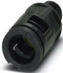
Cable gland, metric thread, IP68/69k protection, straight

Please be informed that the data shown in this PDF Document is generated from our Online Catalog. Please find the complete data in the user's documentation. Our General Terms of Use for Downloads are valid ( http://phoenixcontact.com/download )