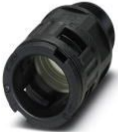
Cable gland, Pg thread, IP68/69k protection, straight

Please be informed that the data shown in this PDF Document is generated from our Online Catalog. Please find the complete data in the user's documentation. Our General Terms of Use for Downloads are valid ( http://phoenixcontact.com/download )