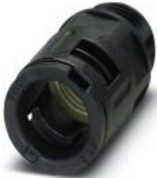
Cable gland, Pg thread, IP68/69k protection, straight

Please be informed that the data shown in this PDF Document is generated from our Online Catalog. Please find the complete data in the user's documentation. Our General Terms of Use for Downloads are valid ( http://phoenixcontact.com/download )