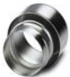
End sleeves as cable protection, made of brass

Cable protection end sleeve - WP-SC BRASS 27 - 3241069