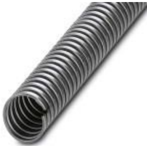
Protective hose in stainless steel

Please be informed that the data shown in this PDF Document is generated from our Online Catalog. Please find the complete data in the user's documentation. Our General Terms of Use for Downloads are valid ( http://phoenixcontact.com/download )