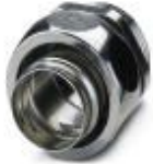
Cable gland made from brass with Pg thread, IP40 protection