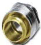
Cable gland made from brass with metric thread, rotatable, IP40 protection