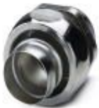
Cable gland made from brass with metric thread, IP40 protection