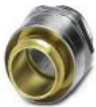
Cable gland made from brass with Pg thread, rotatable, IP40 protection