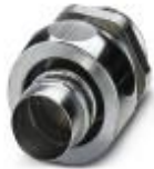
Cable gland made from brass with Pg thread, IP40 protection