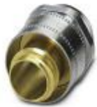
Cable gland made from brass with Pg thread, rotatable, IP40 protection