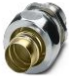
Cable gland made from brass with metric thread, IP40 protection