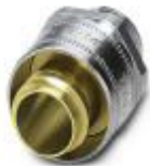
Cable gland made from brass with metric thread, rotatable, IP40 protection