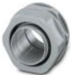
Cable gland made from PP with Pg thread, IP65 protection

Screw connection - WP-G PP HF PG36 - 3240994