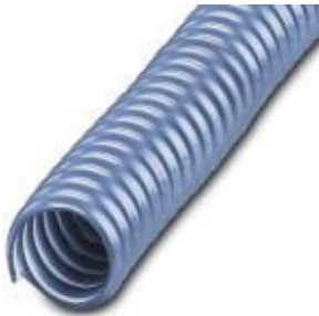
Protective hose, spring steel wire with PU coating, highly stranded

Please be informed that the data shown in this PDF Document is generated from our Online Catalog. Please find the complete data in the user's documentation. Our General Terms of Use for Downloads are valid ( http://phoenixcontact.com/download )