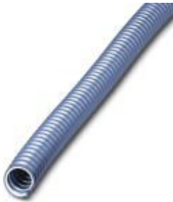
Protective hose, spring steel wire with PU coating, highly stranded

Please be informed that the data shown in this PDF Document is generated from our Online Catalog. Please find the complete data in the user's documentation. Our General Terms of Use for Downloads are valid ( http://phoenixcontact.com/download )