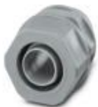
Cable gland made from PP with Pg thread, IP65 protection

Screw connection - WP-G PP HF PG16 - 3240991