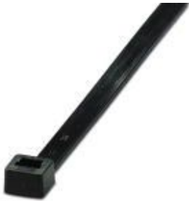
Cable binders for quick and secure bundling, standard version

Please be informed that the data shown in this PDF Document is generated from our Online Catalog. Please find the complete data in the user's documentation. Our General Terms of Use for Downloads are valid ( http://phoenixcontact.com/download )