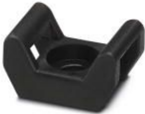
Cable binder base, for cable binders up to 9 mm wide, screwable, 5 mm fixing hole, 2-sided cable binder feed-through

Please be informed that the data shown in this PDF Document is generated from our Online Catalog. Please find the complete data in the user's documentation. Our General Terms of Use for Downloads are valid ( http://phoenixcontact.com/download )