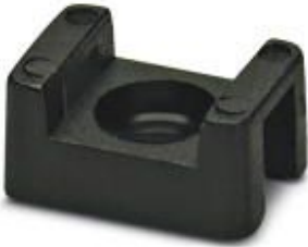
Cable binder base, for cable binders up to 5 mm wide, screwable, 3.5 mm fixing hole, 2-sided cable binder feed-through

Please be informed that the data shown in this PDF Document is generated from our Online Catalog. Please find the complete data in the user's documentation. Our General Terms of Use for Downloads are valid ( http://phoenixcontact.com/download )