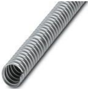
Protective hose in galvanized steel

Please be informed that the data shown in this PDF Document is generated from our Online Catalog. Please find the complete data in the user's documentation. Our General Terms of Use for Downloads are valid ( http://phoenixcontact.com/download )