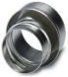
End sleeves as cable protection, made of brass