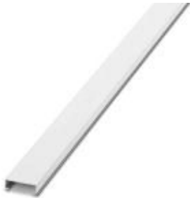
Cover for cable duct, white, width: 40 mm, length: 2000 mm

Please be informed that the data shown in this PDF Document is generated from our Online Catalog. Please find the complete data in the user's documentation. Our General Terms of Use for Downloads are valid ( http://phoenixcontact.com/download )