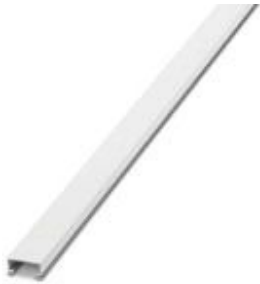
Cover for cable duct, white, width: 30 mm, length: 2000 mm

Please be informed that the data shown in this PDF Document is generated from our Online Catalog. Please find the complete data in the user's documentation. Our General Terms of Use for Downloads are valid ( http://phoenixcontact.com/download )