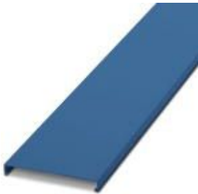
Cover for cable duct, blue, width: 120 mm, length: 2000 mm

Please be informed that the data shown in this PDF Document is generated from our Online Catalog. Please find the complete data in the user's documentation. Our General Terms of Use for Downloads are valid ( http://phoenixcontact.com/download )