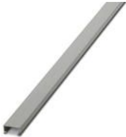
Cover for cable duct, gray, width: 30 mm, length: 2000 mm

Please be informed that the data shown in this PDF Document is generated from our Online Catalog. Please find the complete data in the user's documentation. Our General Terms of Use for Downloads are valid ( http://phoenixcontact.com/download )