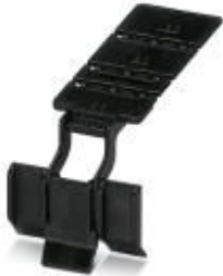
Universal wire holding bracket, perforated, for wiring channels

Please be informed that the data shown in this PDF Document is generated from our Online Catalog. Please find the complete data in the user's documentation. Our General Terms of Use for Downloads are valid ( http://phoenixcontact.com/download )