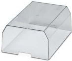
Cover, for the contact- and dust-protected encapsulation of the components

Please be informed that the data shown in this PDF Document is generated from our Online Catalog. Please find the complete data in the user's documentation. Our General Terms of Use for Downloads are valid ( http://phoenixcontact.com/download )