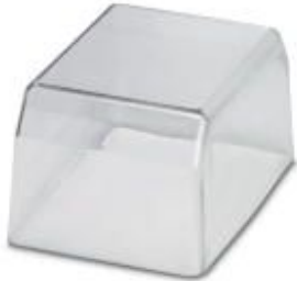
Cover, for the contact- and dust-protected encapsulation of the components

Please be informed that the data shown in this PDF Document is generated from our Online Catalog. Please find the complete data in the user's documentation. Our General Terms of Use for Downloads are valid ( http://phoenixcontact.com/download )