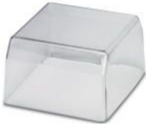
Cover, for the contact- and dust-protected encapsulation of the components

Please be informed that the data shown in this PDF Document is generated from our Online Catalog. Please find the complete data in the user's documentation. Our General Terms of Use for Downloads are valid ( http://phoenixcontact.com/download )