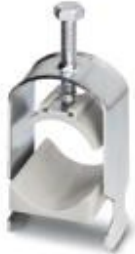
Cable clamp, for DIN rails

Please be informed that the data shown in this PDF Document is generated from our Online Catalog. Please find the complete data in the user's documentation. Our General Terms of Use for Downloads are valid ( http://phoenixcontact.com/download )