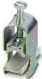
Cable clamp, for DIN rails

Please be informed that the data shown in this PDF Document is generated from our Online Catalog. Please find the complete data in the user's documentation. Our General Terms of Use for Downloads are valid ( http://phoenixcontact.com/download )