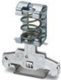
Shield connection terminal block, for applying the shield to busbars

Please be informed that the data shown in this PDF Document is generated from our Online Catalog. Please find the complete data in the user's documentation. Our General Terms of Use for Downloads are valid ( http://phoenixcontact.com/download )