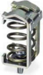
Shield connection terminal block, for applying the shield directly to the conductive mounting plates

Please be informed that the data shown in this PDF Document is generated from our Online Catalog. Please find the complete data in the user's documentation. Our General Terms of Use for Downloads are valid ( http://phoenixcontact.com/download )