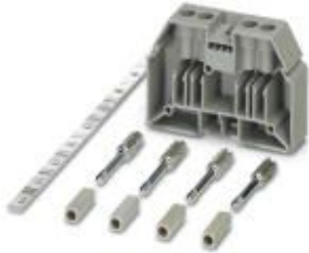
Short-circuit kit for current transformer. Use with panel mounted RBO/RSC 5 feed-through terminals

Please be informed that the data shown in this PDF Document is generated from our Online Catalog. Please find the complete data in the user's documentation. Our General Terms of Use for Downloads are valid ( http://phoenixcontact.com/download )