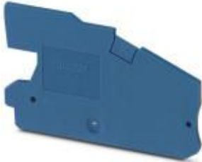
End cover, length: 66.2 mm, width: 2.2 mm, height: 38.6 mm, color: blue

Please be informed that the data shown in this PDF Document is generated from our Online Catalog. Please find the complete data in the user's documentation. Our General Terms of Use for Downloads are valid ( http://phoenixcontact.com/download )