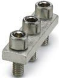
Fixed bridge, number of positions: 3, color: silver

Please be informed that the data shown in this PDF Document is generated from our Online Catalog. Please find the complete data in the user's documentation. Our General Terms of Use for Downloads are valid ( http://phoenixcontact.com/download )