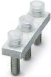
Fixed bridge, pitch: 20 mm, number of positions: 3, color: silver

Please be informed that the data shown in this PDF Document is generated from our Online Catalog. Please find the complete data in the user's documentation. Our General Terms of Use for Downloads are valid ( http://phoenixcontact.com/download )