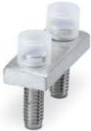
Fixed bridge, pitch: 20 mm, number of positions: 2, color: silver

Please be informed that the data shown in this PDF Document is generated from our Online Catalog. Please find the complete data in the user's documentation. Our General Terms of Use for Downloads are valid ( http://phoenixcontact.com/download )