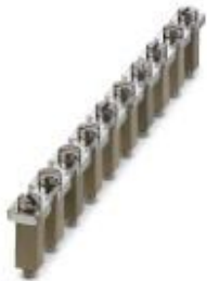
Fixed bridge, pitch: 17 mm, number of positions: 10, color: silver

Please be informed that the data shown in this PDF Document is generated from our Online Catalog. Please find the complete data in the user's documentation. Our General Terms of Use for Downloads are valid ( http://phoenixcontact.com/download )