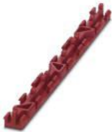
Coding plates, color: red

Please be informed that the data shown in this PDF Document is generated from our Online Catalog. Please find the complete data in the user's documentation. Our General Terms of Use for Downloads are valid ( http://phoenixcontact.com/download )