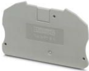
End cover, length: 75.4 mm, width: 2.2 mm, height: 45.6 mm, color: gray

Please be informed that the data shown in this PDF Document is generated from our Online Catalog. Please find the complete data in the user's documentation. Our General Terms of Use for Downloads are valid ( http://phoenixcontact.com/download )