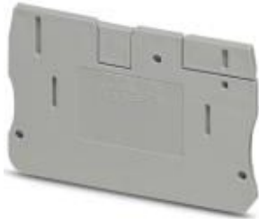
End cover, length: 57.7 mm, width: 2.2 mm, height: 36 mm, color: gray

Please be informed that the data shown in this PDF Document is generated from our Online Catalog. Please find the complete data in the user's documentation. Our General Terms of Use for Downloads are valid ( http://phoenixcontact.com/download )