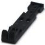
Strain relief, length: 48.7 mm, width: 9.3 mm, number of positions: 2, color: black