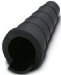
Bend protection sleeve, for cable diameter of 4 mm ... 12 mm, diameter: 12 mm, color: black

Please be informed that the data shown in this PDF Document is generated from our Online Catalog. Please find the complete data in the user's documentation. Our General Terms of Use for Downloads are valid ( http://phoenixcontact.com/download )